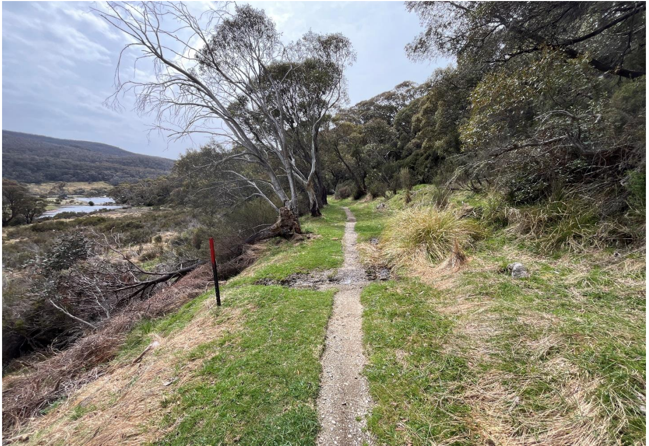
Photo 3: Looking north from the southern limit of the 50 m section where the pipe will need to be replaced.