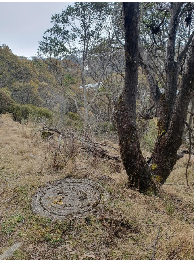
Photo 2: Typical of the nine mostly Black Sallee trees to be removed as part of the proposed works.