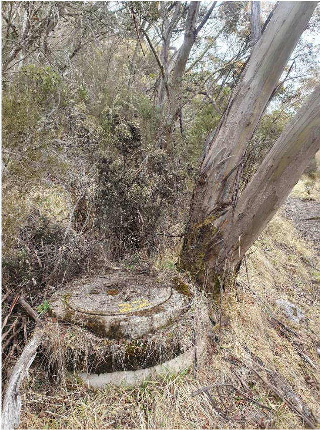
Photo 1: The nine trees to be removed. All mature Black Sallee or Eucalyptus dalrympleana subsp. dalrympleana (Mountain Gum) trees that are located in very close proximity to the existing manholes. Whilst they are mature, none are old-growth or hollow-bearing having presumably grown since the initial installation of the sewer main.