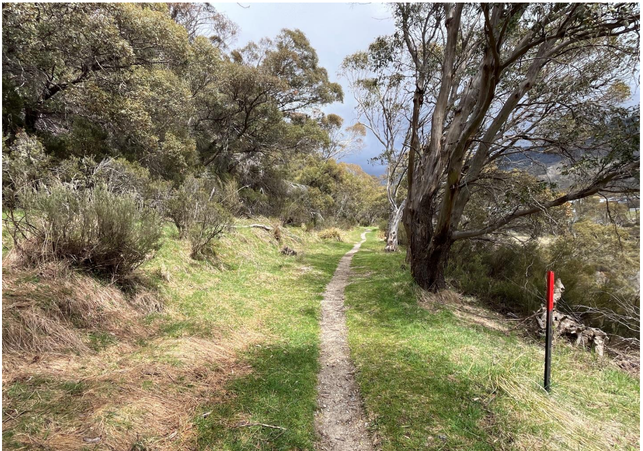
Photo 4: Looking south from the northern limit of the 50 m section where the pipe will need to be replaced.